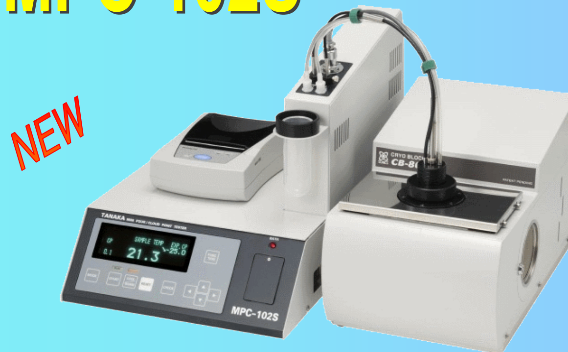
MPC-102S shown with optional printer "BS2-80TS"